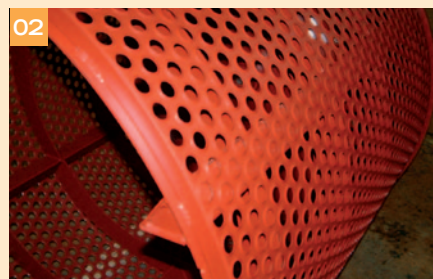
01, 02 - Drum detail